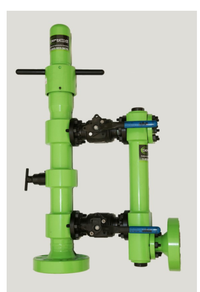
Flow Block Replacement Configuration